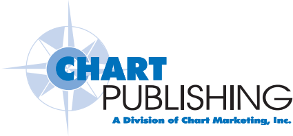
CHART Publishing offers plaques in one and two-page layouts. Your 4-color layout will be printed on a metal plate utilizing the latest printing processes available - then mounted on a rich walnut laminate plaque. At the bottom, we will include an engraved plate annotating the magazine name and year it was produced.